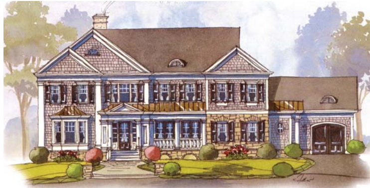
The Hamilton Lot #5 6,530 sq. ft.