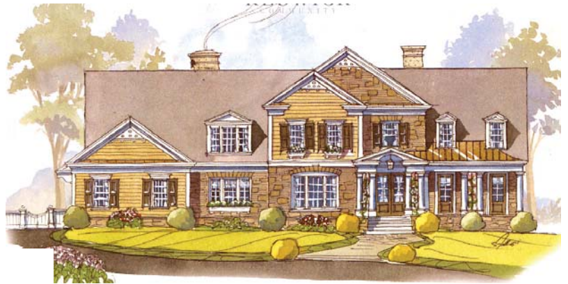
The Jefferson Lot #4 6,377 sq. ft.